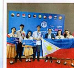
FIRST & THIRD PLACER 9th ASEAN Student Science Project Competition (ASPC 2023) in Pathum Thani, Thailand