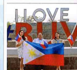
OUTSTANDING DELEGATE & BEST POSITION PAPER International Model United Nations Vietnam 2023