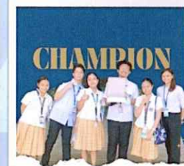
CHAMPION Ateneo de Manila University's Management of Applied Chemistry Association: Catalyze