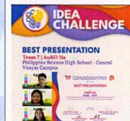
BEST PRESENTATION NMMME Summit 2023 - Liwayway: Illuminating Possibilities from Old CoMMModities