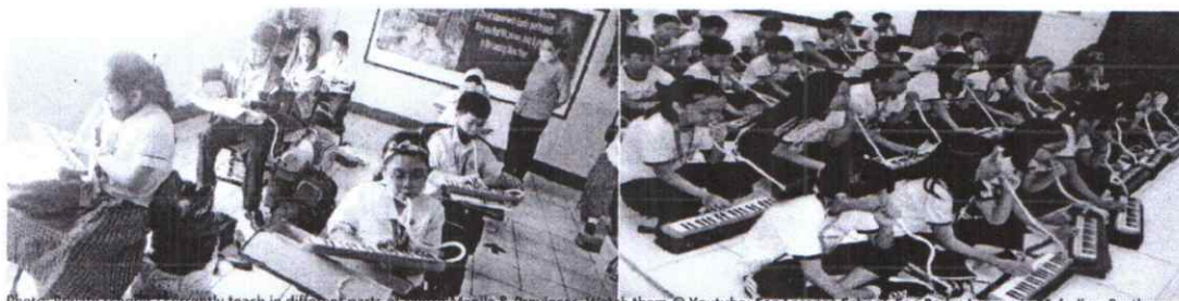
Photo: Private schools currently teach in different parts of metro Manila & Provinces. Watch them @ Youtube: San Lorenzo School , San Pedro Laguna in Melodica , & others.