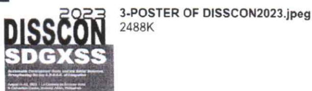
3-POSTER OF DISSCON2023.jpeg 2488K