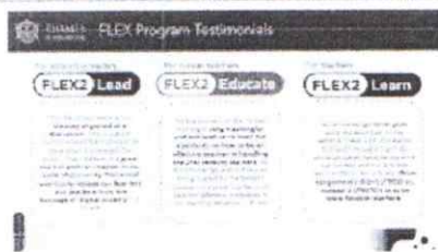
FLEX Testimonials.png 140K