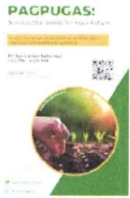
Updated Poster.png 719K