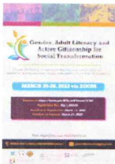
GALACST OFFICIAL POSTER.png 5201K