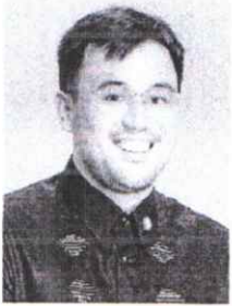
Hon. Christopher de Venecia Representative, 4th District of Pangasinan House of Representatives of the Philippines